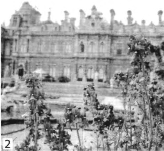
(1) Paris Residence of Jacob James Rothschild (2) Waddesdon Manor (Mansion) A Rothschild country residence in England